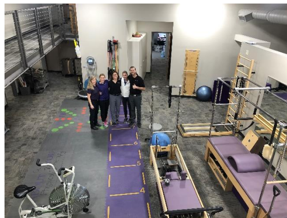
Part of the AYPT team