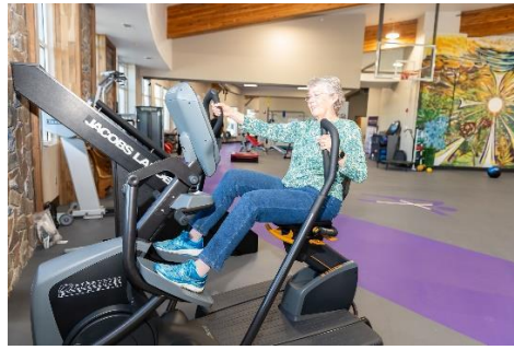
About You Training Campus